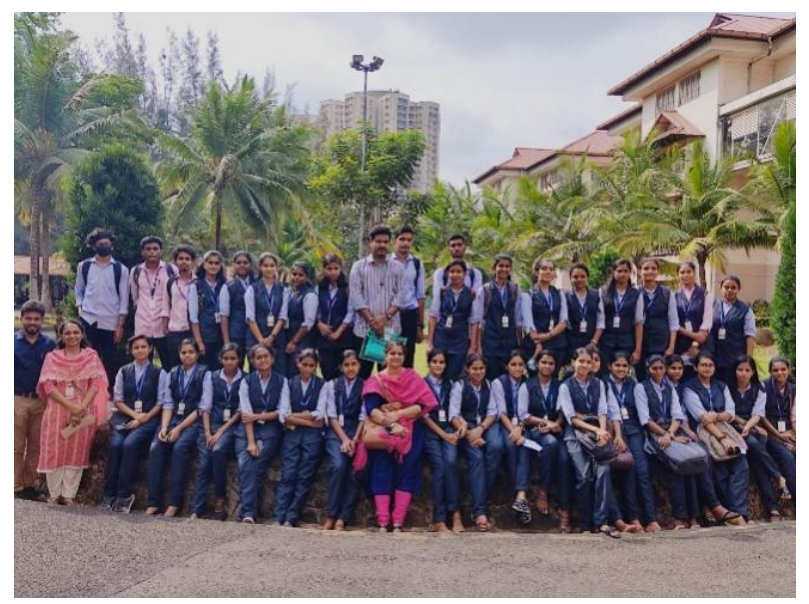
Students at the Rajagiri campus